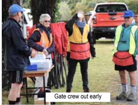
Gate crew out early