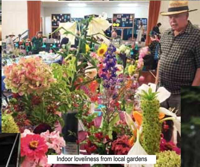
Indoor loveliness from local gardens