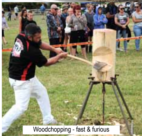
Woodchopping - fast & furious