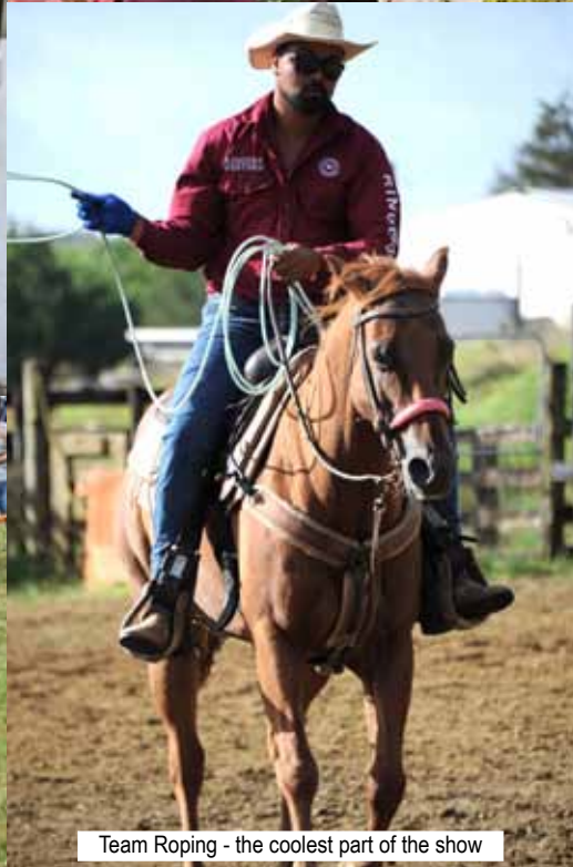
Team Roping - the coolest part of the show