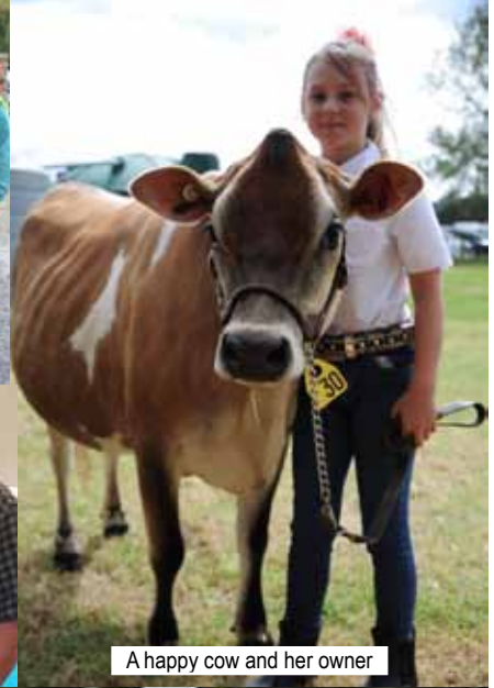
A happy cow and her owner