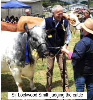
Sir Lockwood Smith judging the cattle