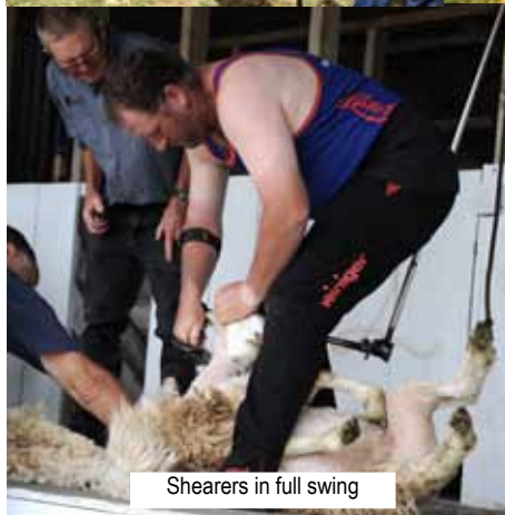
Shearers in full swing